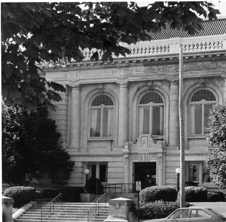
The Swenson Center is housed on the third floor of Denkmann Library on the Augustana College campus.

Genealogy classes. This spring, the Center opened its doors in the evenings to some 20 persons armed with notebooks, pens, and Swedish ancestors.